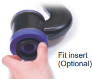
Fit insert (Optional)