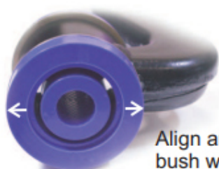
Align arrows on bush with arm